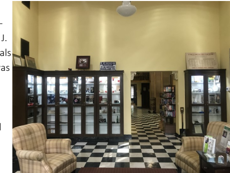
The History Cases at B.F. Jones Memorial Library.

If you are in possession of any items that are illustrative of the history of Aliquippa, and would like to donate it to this project, please contact the Library.